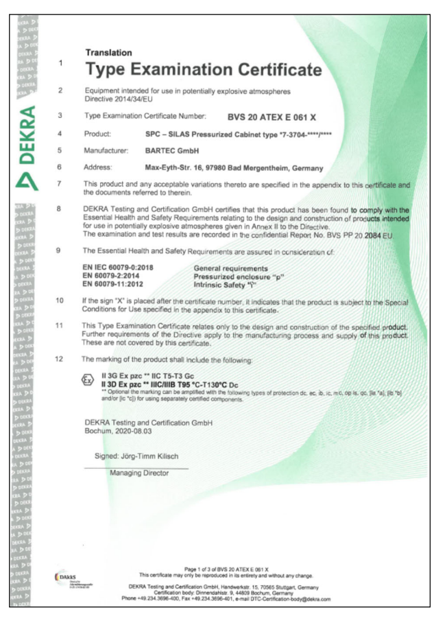
↑ A voluntary certificate from a genuine recognized Notified Body, DEKRA GmbH.

But there is only a 'certificate' when a Notified Body is first involved. This may be a 'Unit Verification Certificate' (for one-off production), but it is usually an 'EU Type Examination Certificate' (for serial production).