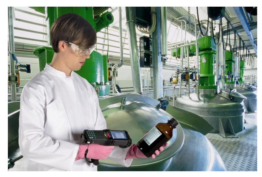
↑ An Ex certified mobile computer – but always remember: is this device suitable for the relevant zone?

Whether the purchaser or user of the product is insured if it turns out to be a dubious product will have to be made clear. Should it go wrong, it can go so wrong that there is practically no evidence left. If the cause can be found, the manufacturer will have some explaining to do in court. It would probably mean the end of the company.